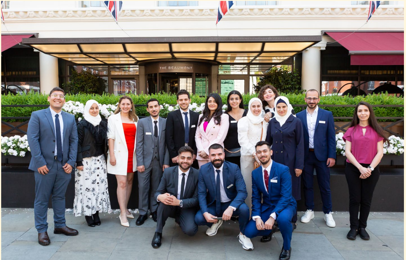
Saïd Foundation scholars at the Foundation's Annual Lunch

The Saïd Foundation scholarship programme aims to empower through educational opportunities and to contribute towards the development of our target countries of Syria, Jordan, Lebanon and Palestine. The scholarship programme is aimed at outstanding individuals who have the potential to make a positive impact in their countries, and equips them with the skills and knowledge they need through postgraduate studies in the