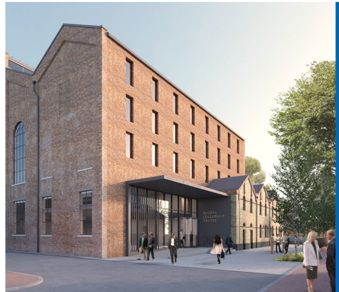
The proposed new entrance to the Global Leadership Centre

In 2018, the Saïd Foundation committed a gift of £15 million for the redevelopment of the historic Osney Power Station as the School's new Global Leadership Centre. The centre is a major new development for the School and will serve as a hub for executive education, providing a space for learning, networking, and reflection in the heart of Oxford. The teaching and residential facility will welcome leaders of global business, government and civil society and give them access to the University's leading academics and brightest minds. The centre will be fully operational from summer 2025.