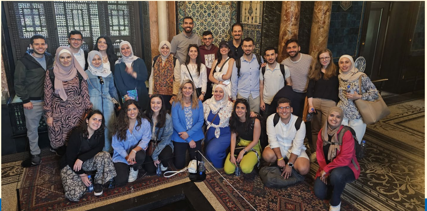
Saïd Foundation scholars on a visit to Leighton House