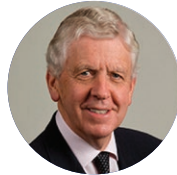
Lord Powell of Bayswater KCMG