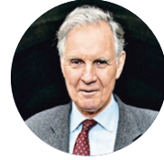
Reverend Jonathan Aitken