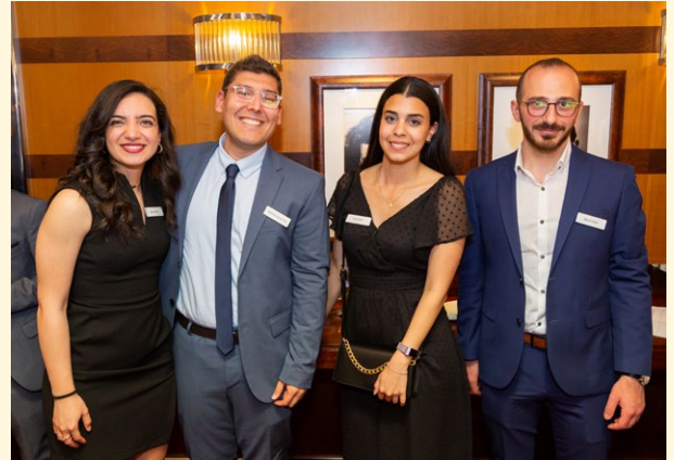
Saïd Foundation scholars at the Foundation's Annual Lunch