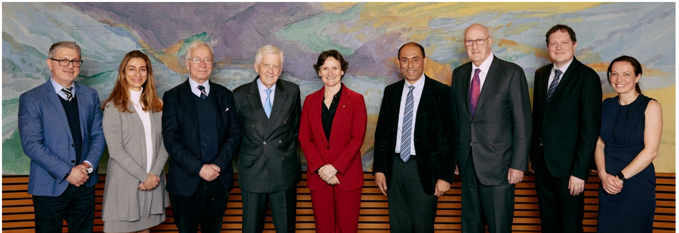
The Saïd Business School Foundation annual board meeting at the Saïd Business School.