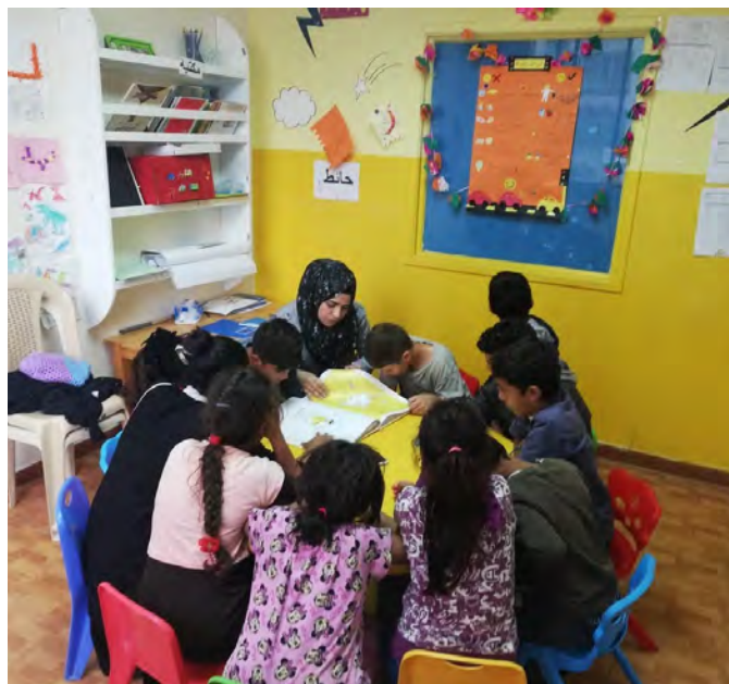
A psycho-social support session with case worker, Aya in Tripoli.

Taking a holistic approach, the Building a Better Tomorrow programme is focused on not only improving children's access to a high-quality education, but also supporting their mental wellbeing and physical safety.