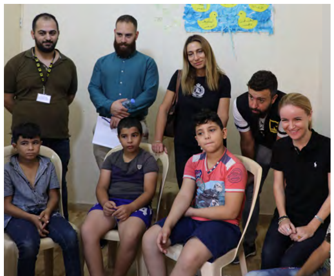
The Saïd and Asfari Foundations visiting Tripoli in October 2019.

In Year Two of the programme, the IRC will start working with two local partners – LebRelief in Tripoli, and another partner to be confirmed – to broaden the reach of activities, whilst also strengthening local capacity to deliver support to Syrian refugees. We will also be training local outreach volunteers in Bekaa and Akkar, to establish contact with vulnerable communities and improving access to services for children and adolescent girls.